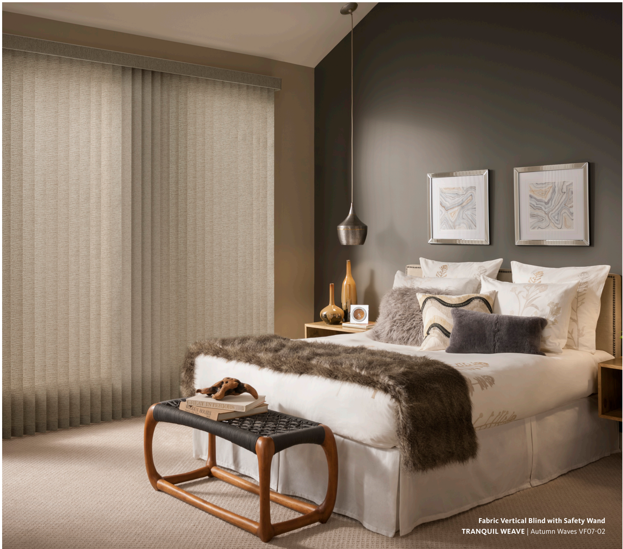
Fabric Vertical Blind with Safety Wand TRANQUIL WEAVE | Autumn Waves VF07-02

Alta stands by our products with a Limited Lifetime Warranty.